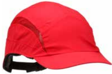
3M™ First Base™ 3 Classic Bump Cap

Lightweight cap with micro-fibre fabric and flexible shell design.