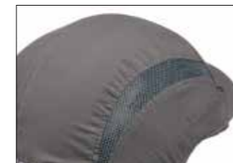
Wide ventilation panel