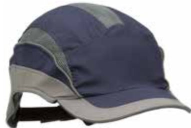
3M™ First Base™ 3 Elite Bump Cap

Lightweight cap with micro-fibre fabric and flexible shell design.