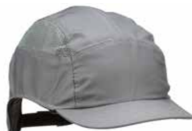
3M™ First Base™ 3 Extra Bump Cap

Dual colour micro-fibre cap with reflective piping and flexible shell design.