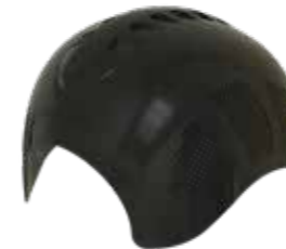
Full shell option offers increased coverage