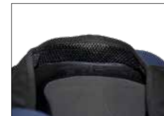
Spacer backed sweatband