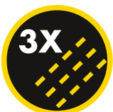
TRIPLE STITCHED SEAMS