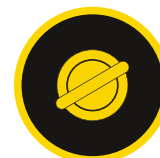
NON-SCRATCH HEAVY DUTY FIXING STUD