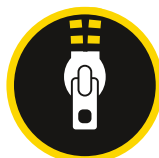
YKK MAIN ZIP LIFE TIME WARRANTY